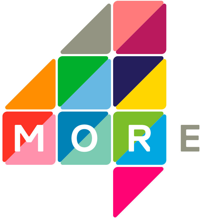
The More4 logo